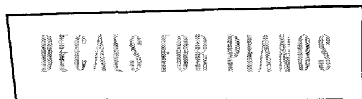
FRONT OF DECAL